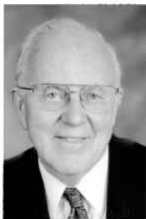
Presidential Musings page 2