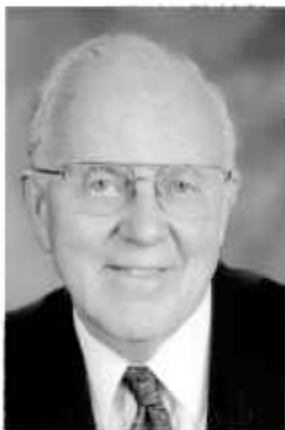
Presidential Musings page 2