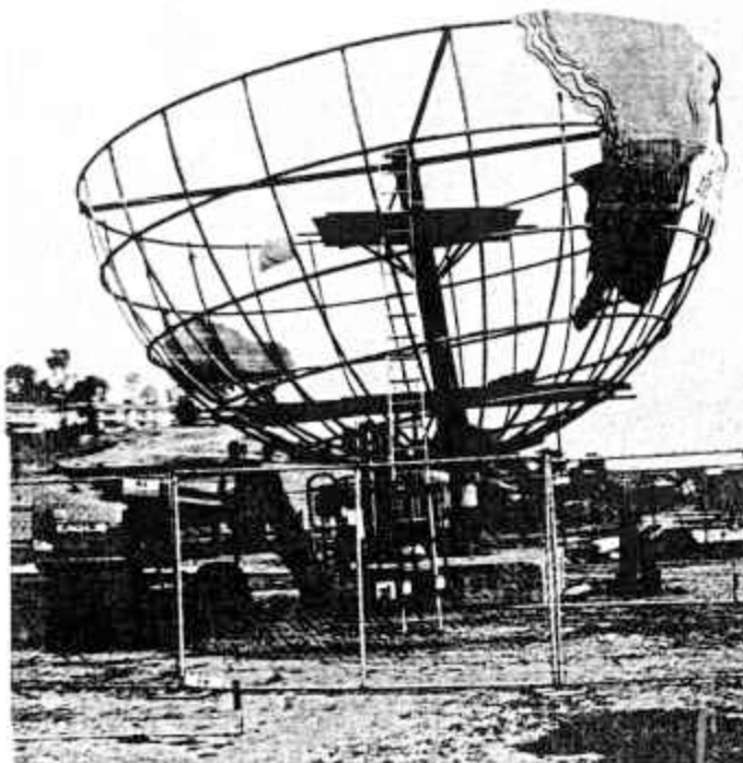
One step in the move from Laguna Hills to Laguna Woods