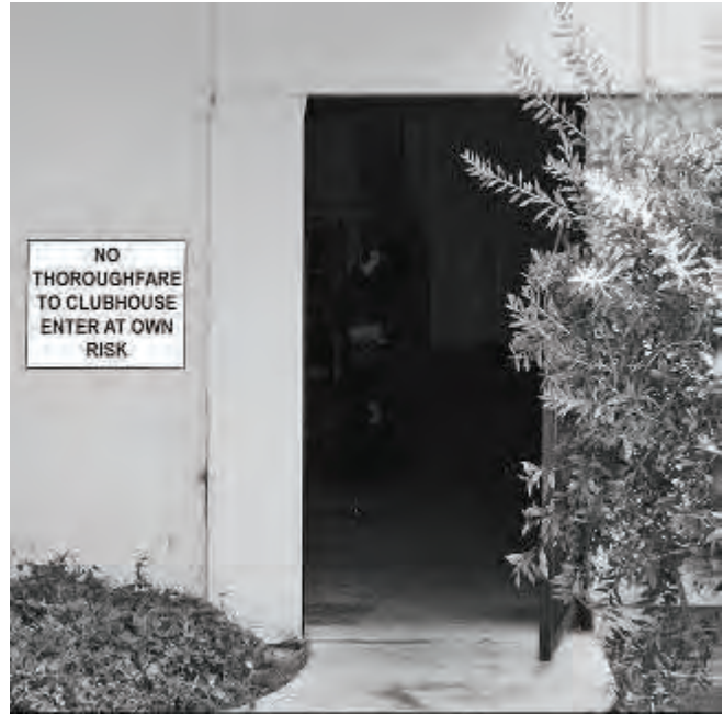
Since July 1973 residents using Clubhouse 4 have been asked to use the pedestrian walkways rather than the buildings and garages.

In October, 1973 Contempo notified GRF that GRF's request for an easement that would have allowed access to Clubhouse 4 from the private road servicing the Contempo Mobile Home park was denied. At the