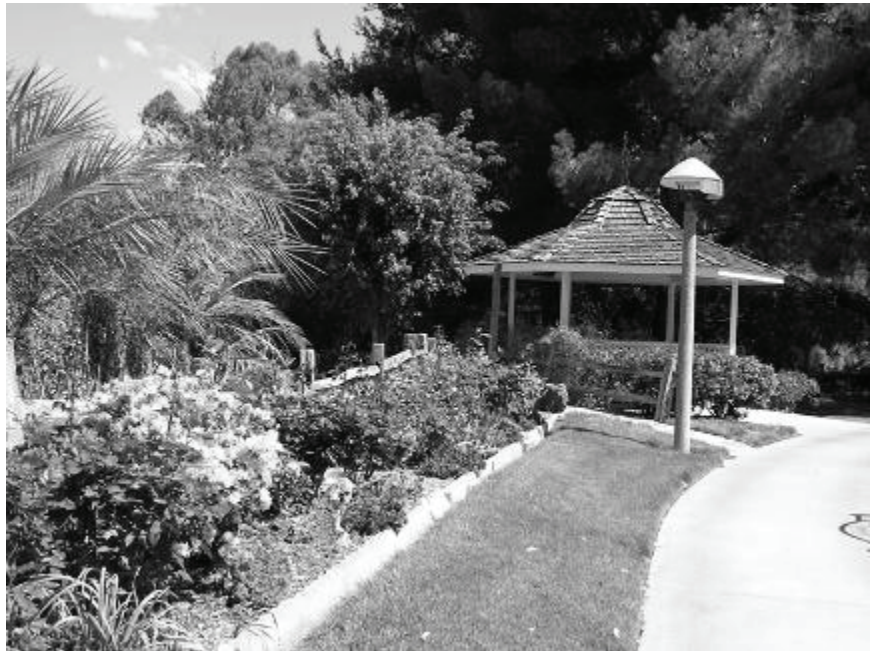
Residents enjoy the scenic walkways at The Willows.

With all this came a substantial bonus for both parties. Rossmoor offered to construct the site using Leisure World's La Casita, Casa Bonita, Encanto and Hermosa floor plans. The price was much lower than The Willows might have secured from any other contractor. This proposal was made in March, 1971 and