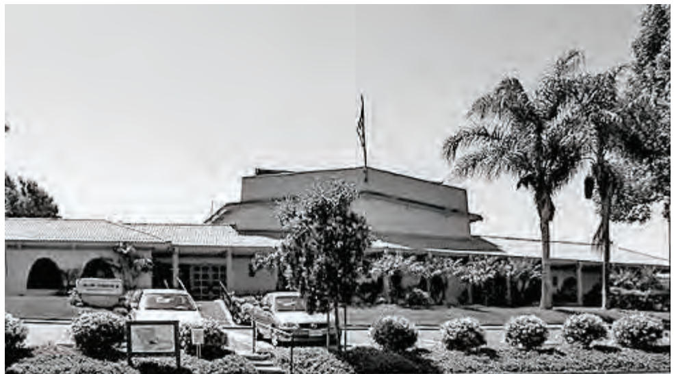
The Willows Administration Building. The Willows is located on Santa Maria Avenue, adjacent to the Village's Gate 8.