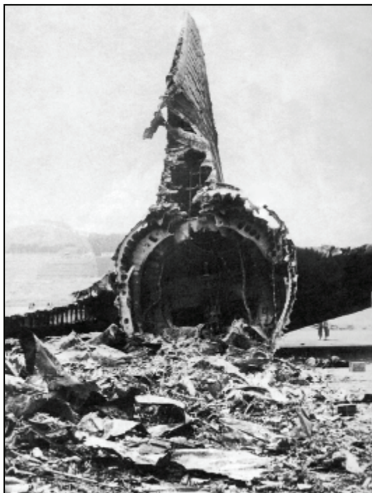
The remains of the KLM 747 jumbo jet.

Today, a monument sits above the scene of the accident at Tenerife, Canary Islands, where for the 30 th anniversary on March 27, 2007, Dutch and American next of kin joined in the ceremonies together for the first time. A monument to the victims also stands in