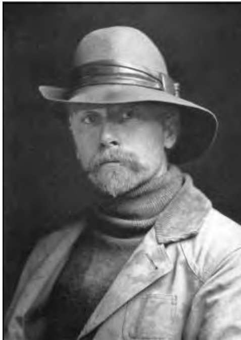
Edward Sheriff Curtis, self-portrait, 1899

In the years that followed the completion of the North American Indian project Curtis involved himself in mining ventures and continued to do occasional work in Hollywood. Around 1947 he settled