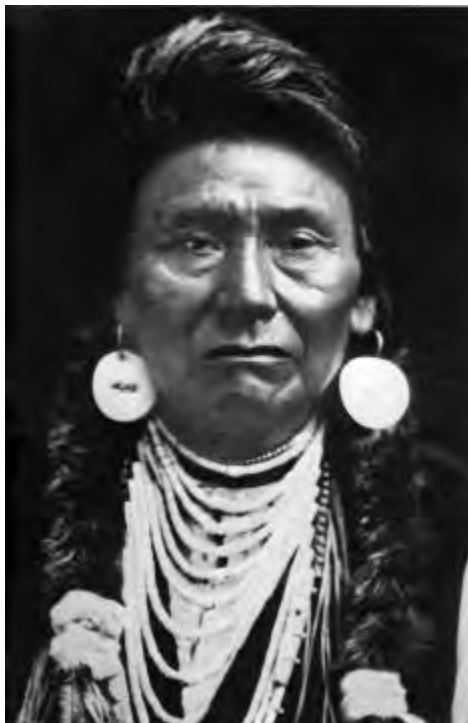
Chief Joseph–Nez Percé (below). This Curtis portrait is typical of many taken by Curtis. Popular opinion has given Chief Joseph the credit of conducting a remarkable strategic movement from Idaho to northern Montana in the flight of the Nez Percés in 1877.