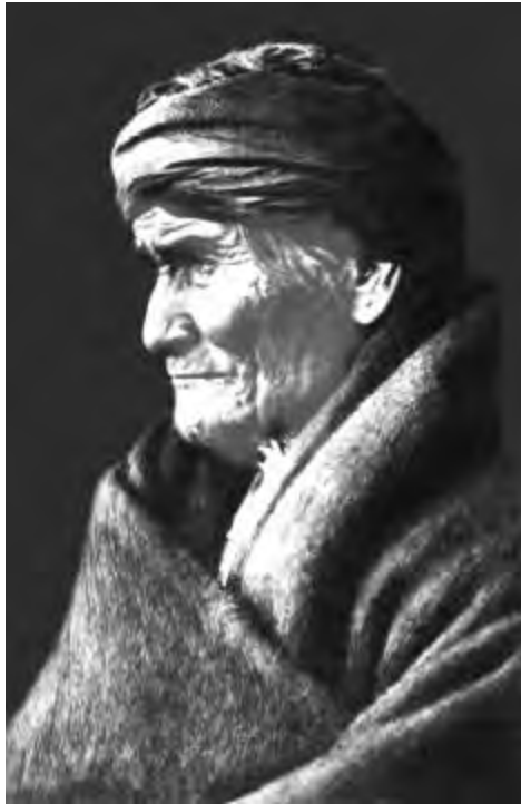
Geronimo–Apache (above). Curtis' portrait of the historical old Apache was made in 1905 when he was 76 years old. It was taken at Carlisle, Pennsylvania, the day before the inauguration of President Theodore Roosevelt.