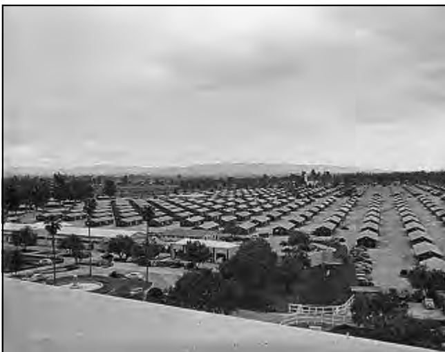
Santa Anita Racetrack was converted to a temporary internment camp for persons of Japanese ancestry. It was used between March 27 and October 27, 1942. Peak population was 18,719.