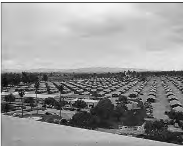
Santa Anita Racetrack was converted to a temporary internment camp for persons of Japanese ancestry. It was used between March 27 and October 27, 1942. Peak population was 18,719.