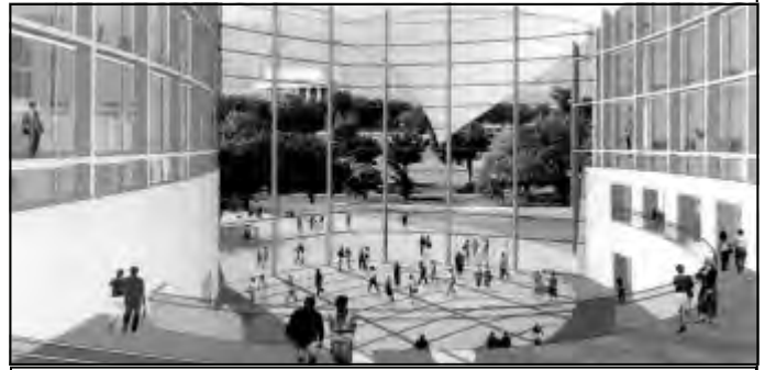
More than 500,000 visitors are expected to visit the Public Education Center each year.