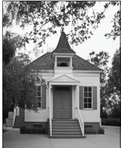
The El Toro Grammar School, built in 1891, became St. Anthony’s Catholic Church in 1914. In 1976 it was moved to Heritage Hill in Lake Forest.