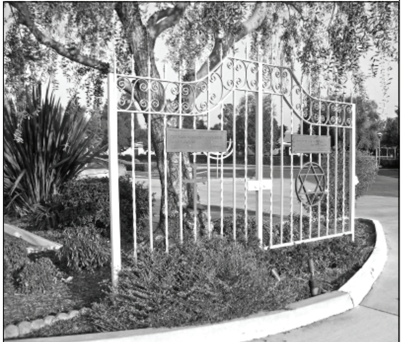
Friendship Gate provides evidence that peace and harmony that can exist between people of different faiths.