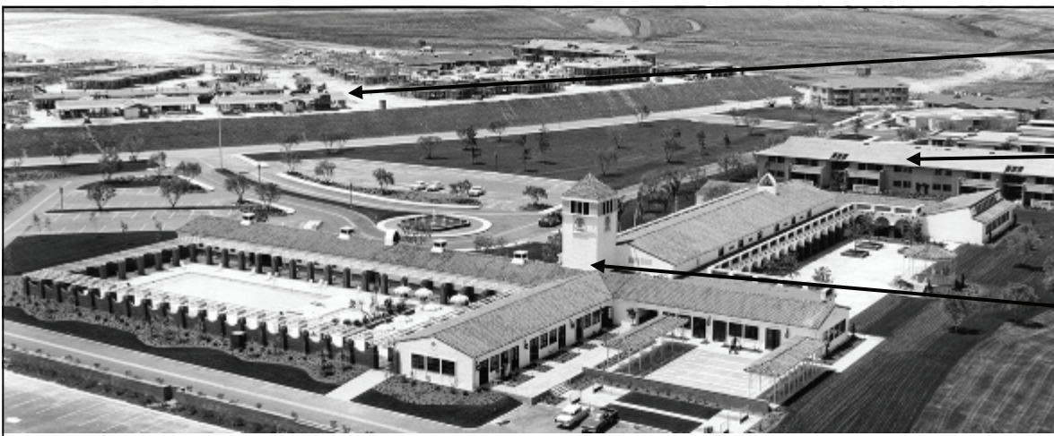
Leisure World – July 15, 1964. Pictured are: (1) Clubhouse I; (2) the first model homes adjacent to the shuffleboard building; and (3) the first buildings to be occupied by new owners.

Your 2010 Society Membership Enclosed with this newsletter is the form to renew your tax-deductible membership for the 2010 calendar year.