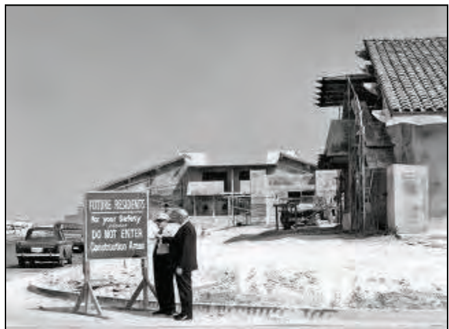
Early housing construction adjacent to Gate 1.

Across from the busy scene at the sales level and one elevation higher, workers scurried like ants swarming from their nests to complete the first three residential buildings. Three blocks of paved streets were ready, Avenida Sevilla to Avenida Castilla and Calle Aragon