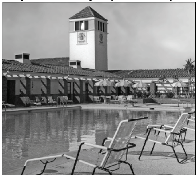
Clubhouse I tower and carillon on December 2, 1963. A clock was added sometime before September 1980.

No doubt some slept uneasily the first night. The large 16-manor buildings, only half full, with open