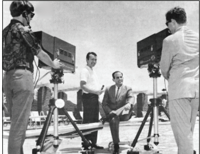
Channel 6's staff tests new technical systems which will allow them to present programs from outdoor locations. On July 19th programming originated live from poolside at Clubhouse I.

On June 1 st , GRF took over Rossmoor's contract with