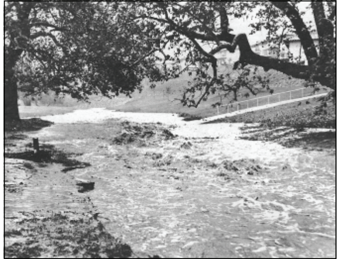
The usually placid Aliso Creek was the scene of turbulent runoff as eight inches of rain fell over five days in early December 1966.

On November 17 th , St. George's Episcopal Mission,