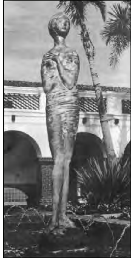
The Veil by Pino Conte taken in 1966.

Conte's early statues appear to have been inspired by a profound sense of religion.