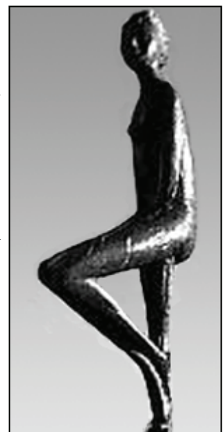
Mirragio by Pino Conte.