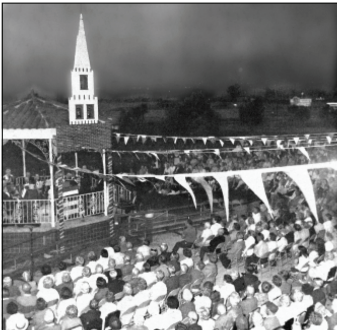
More than 3,200 packed the bandstand at Clubhouse I for the July 4, 1966 celebration. The Leisure World Orchestra, sitting in the gazebo, and a replica of the Old North Church in Boston provided a background for the program.