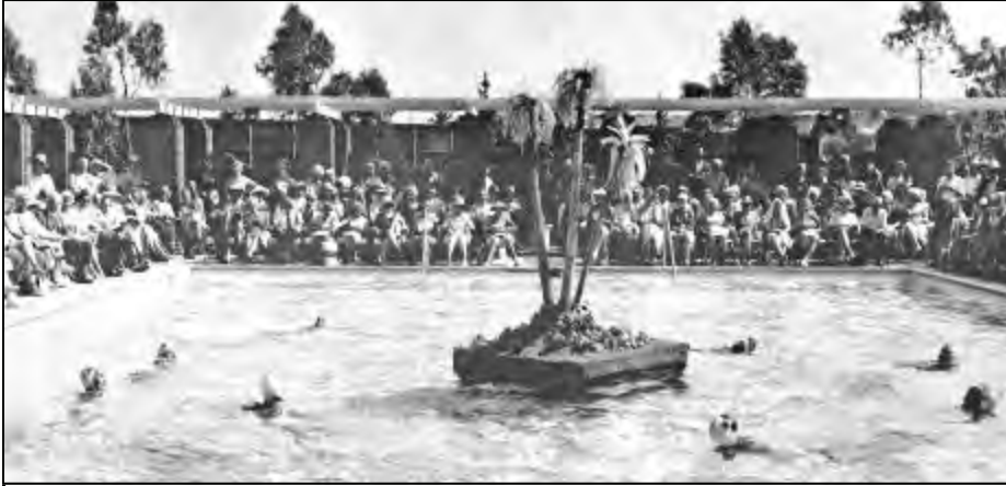
Residents watched the aquatic ballerinas perform at a water carnival on May 13-14, 1966 at Clubhouse I.

Laguna Coast Wilderness Park. Laguna Beach purchased this parcel in 1978.