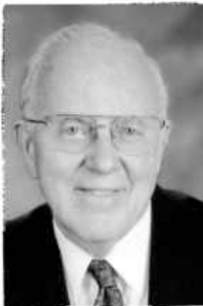
Presidential Musings page 2