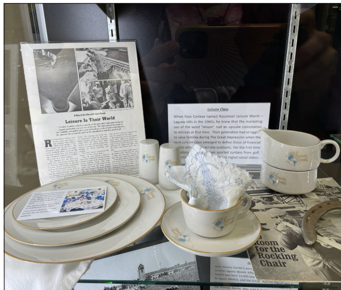
Elegant Leisure World china was used for the earliest banquets held at Clubhouse 1. The china is displayed in an exhibit at the Laguna Woods History Center.

For information, call 949-206-0150 or visit LagunaWoodsHistory.org.