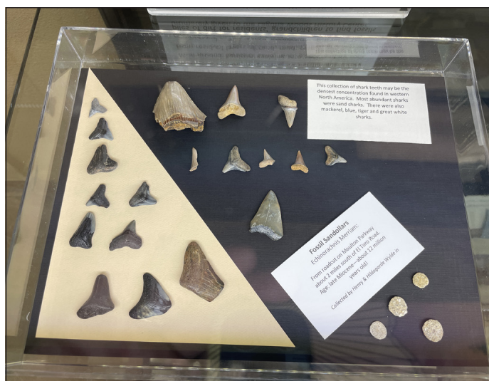
Fossils dug up by grandchildren of Leisure World’s earliest residents in the 1960s are displayed in the exhibit.